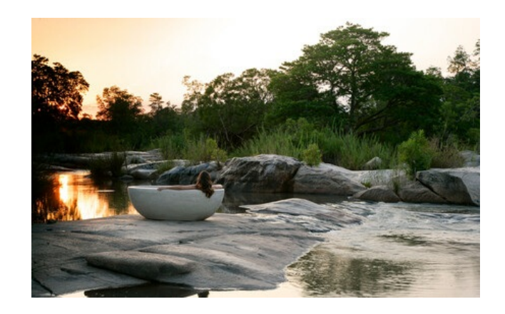
Member Relais & Châteaux since 1993 Sabi Sands Game Reserve 1350, Kruger National Park

Lodge and restaurant in a game reserve. True to its name, Londolozi has become a place that kindles the aspiration for a better collective future for all. We are a socially, economically and environmentally responsible business, representing the life's work of a family-owned and run operation built on solid foundations and almost a century of exploring new frontiers. It represents the dream of a planet abounding in open spaces, where wild animals and people live together in dignity and harmony.