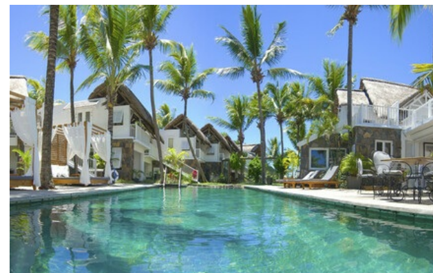
Member Relais & Châteaux since 2013 Coastal Road, Pointe Malartic Grand-Baie Pointe aux Canonnières

Hotel and restaurant on the seafont. A delightful colonial mansion, nestling in a coconut grove right at the water's edge, is home to a tastefully appointed, charmingly refined little hotel. The soft, neutral shades of Flamant Home Interiors furniture in its individually designed guest rooms stand in brilliant contrast to the blue of the sea and green of the coconut palms, instilling deep feelings of peace and seclusion. The restaurant, also at the water's edge, serves delicious creole and international dishes. However 20 Degrés Sud Boutique-hôtel has two more treasures in store: the M/S Lady Lisbeth, the oldest motorboat on the island which, when evening falls, takes a party of guests to dine under the stars on the calm waters of the bay.