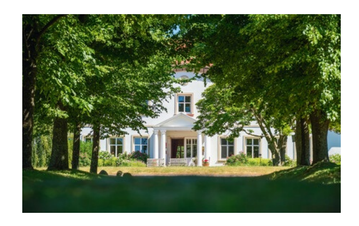
Member Relais & Châteaux since 2001 Peenstrasse 33 17391, Stolpe an der Peene (Mecklenburg-Vorpommern)

Hotel and restaurant on a river. This mansion, located at the heart of the Peenetal Nature Park, a European Destination of Excellence, overlooks the protected river. The White-tailed Sea Eagles and the beaver will be your neighbours during your stay in the 19th century manor house. You can appreciate the Chef's culinary delights during an à-la-carte breakfast, a picnic in the 10 hectare park or a dinner at the restaurant or the historic inn "Stolper Fährkrug". Exceptional moments throughout the year and not only during the music festival... You can choose between a Wellness Lounge, a bath tub on the bank of the river Peene, a little boat in the natural harbour and a photo safari to the moorland.