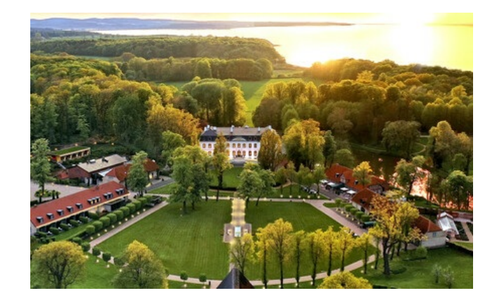
Member Relais & Châteaux since 2018 Parkallee 1 23758, Weissenhaus

Main Restaurant: lunch and dinner from Sunday to Tuesday (except bank holidays). "Restaurant BOOTSHAUS": Wednesday.