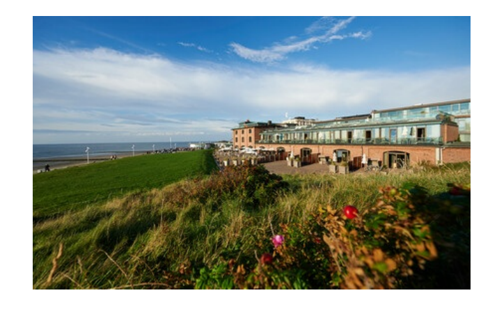
Member Relais & Châteaux since 2010 Damenpfad 36a D-26548, Norderney (Niedersachsen)

Hotel and restaurant on the seafront. Dating back to the 18th century, Hotel Seesteg was once the building in which the wooden boards of the pier were stored during the stormy winters on the North Sea coast. Today, it has been converted from a storehouse into an exceptional, relaxing haven. Everything is designed to offer an unparalleled, intimate atmosphere and smart style and design. Every room faces the sea and the outdoor rooftop pool offers breathtaking views of the Wadden Sea National Park, a Unesco World Heritage site. The large floor-to-ceiling windows boast a direct view of the white sand beach.